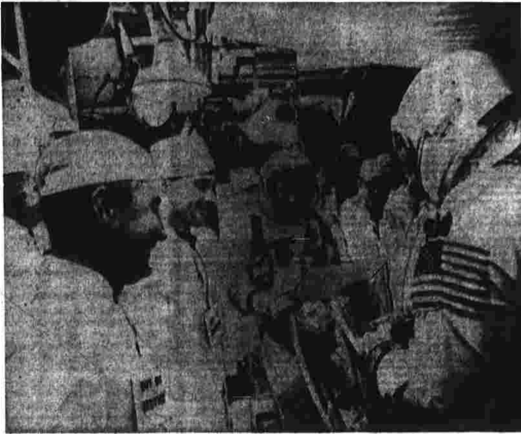
'Out of Service' tags worn by Astronauts Gus Grissom (left) and John Young (second left) proved prophetic today as their fellow spacemen Walter Schirra (holding card) and Thomas Stafford (back to camera) wound up that way when their Gemini 6 flight was scrubbed. Above scene took place as Schirra and Stafford prepared to enter capsule.